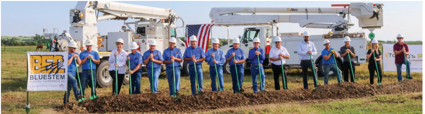
Bluestem Electric board of trustees, staff and legal counsel hold a groundbreaking ceremony at their St. George Sun Power Solar project.

Twelve Kansas Electric Cooperatives are investing in 20 megawatts (MW) of solar power to be deployed across 800 miles of the state, and provide power to 80,000 homes in rural Kansas.