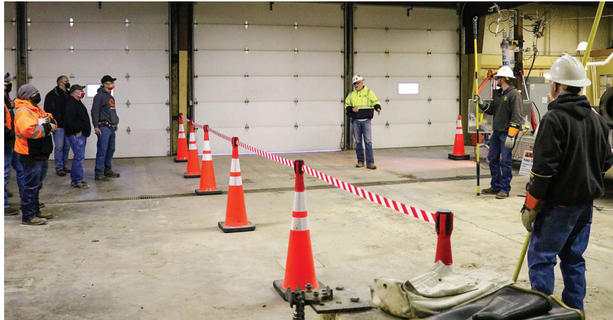
From left: Linemen Courtney Grater, Baylee Easterberg and Kevin Swenson review safety tips.

The trailer is equipped with transformers that produce 7,200 volts. Bluestem linemen demonstrated what happens when objects come in contact with power lines and what to do if there is an accident involving power lines, which includes staying away from any power lines that